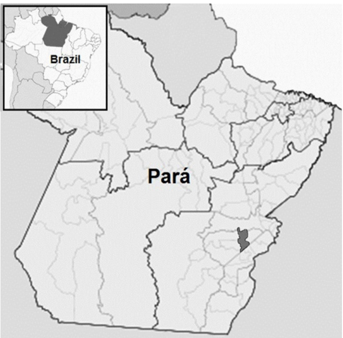
Figure 1 Map of the state of Pará showing the municipality of Curionópolis, north region of Brazil (inset).

The present communication reports the opportunistic consumption of the meat of jaguar by residents of the municipality of Curionópolis ( 6^{\circ}24^{\circ}57.9^{\circ} S / 49^{\circ}39^{\circ}0.9^{\circ} W), southeastern of the